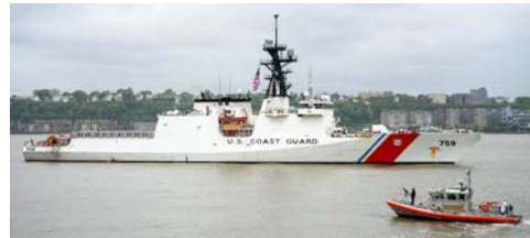
◀ U.S. Coast Guard Cutter Calhoun, a Legend-class National Security Cutter..

The Navy announced on December 17 that it plans to build a replacement FF(X) frigate based on a Coast Guard cutter already in service. The Navy said in a statement, “The FF(X) will be a smaller, more agile surface combatant designed to complement the fleet’s larger, multi-mission warships and enhance operational flexibility around the globe.”